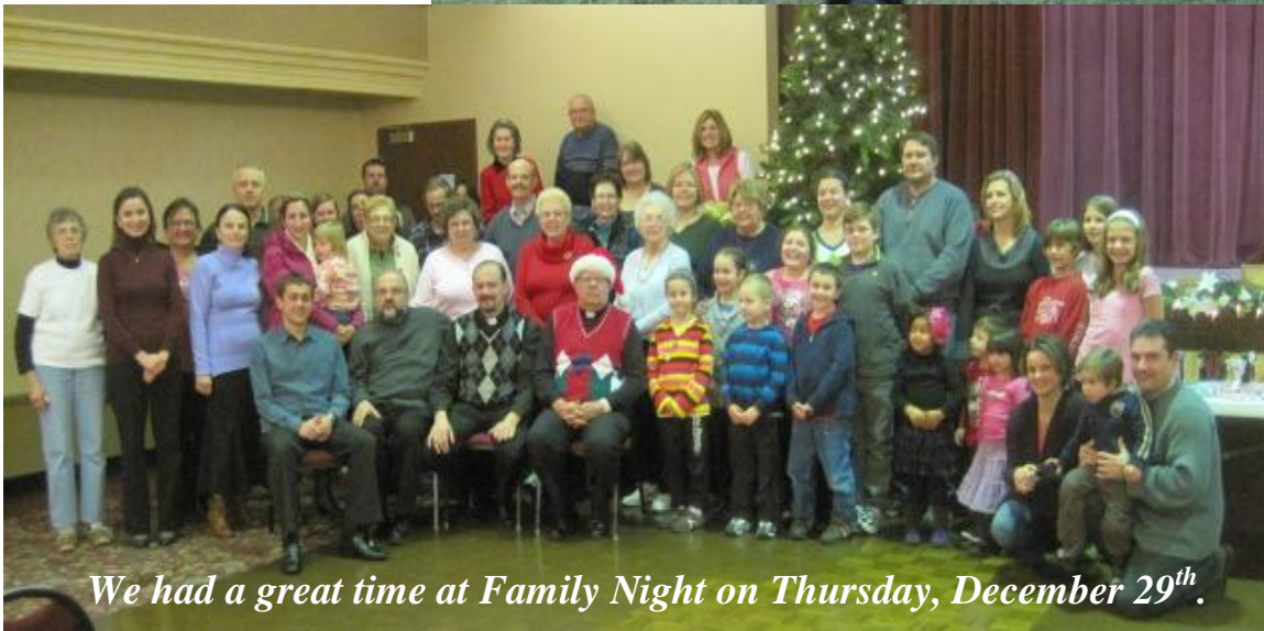
We had a great time at Family Night on Thursday, December 29 th .