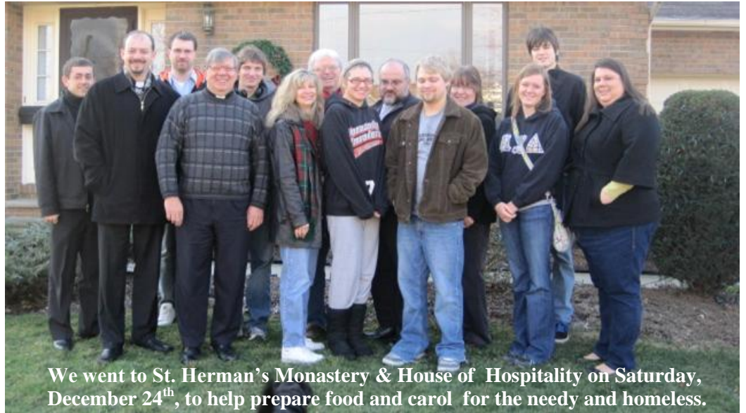
We went to St. Herman's Monastery & House of Hospitality on Saturday, December 24 th , to help prepare food and carol for the needy and homeless.