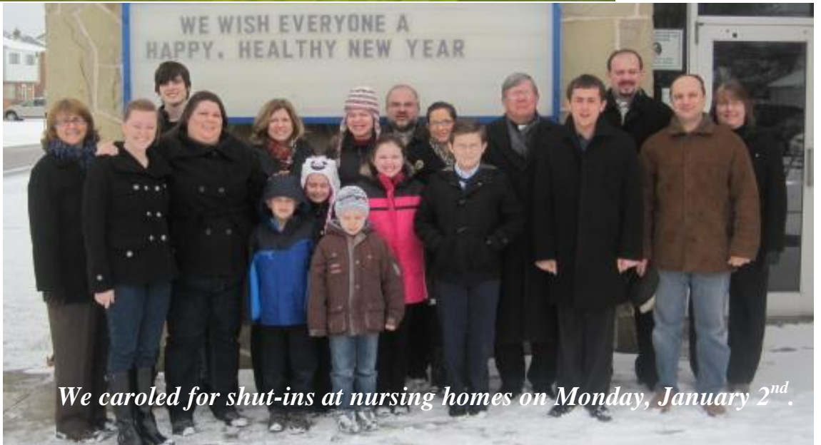
We caroled for shut-ins at nursing homes on Monday, January 2 nd .